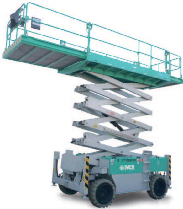
IT 220 Series Manual double asymmetric deck extension (2 m front + 0.9 m rear).