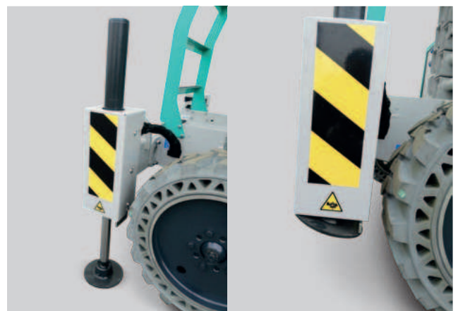
IM 180 Series Automatic hydraulic stabilization system available as optional in all models.