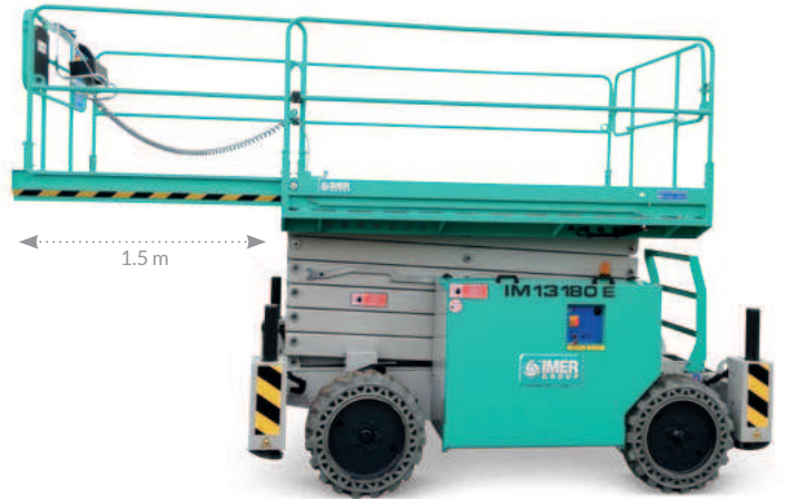
IM 180 Series Manual deck extension of 1.5 m for a total length of 4.2 m.