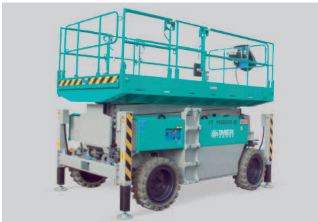
IT 220 Series Compact dimensions (2.20x3.92 m).