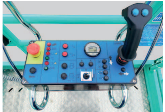
Simple and intuitive control box that can be removed from the basket for loading / unloading the machine.