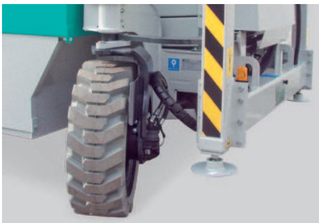
Easy to be driven thanks to the reduced steering angle.